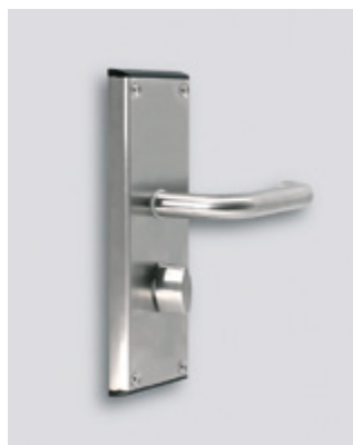
Back view / knob for deadbolt