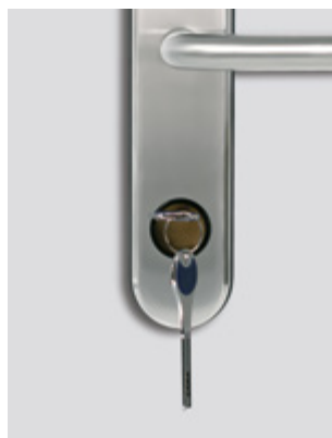
Emergency override key