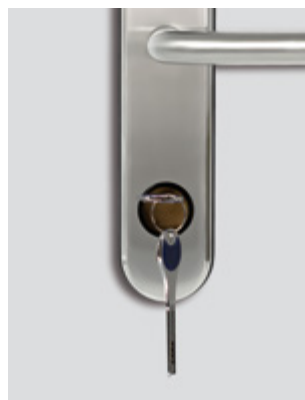
Emergency override key