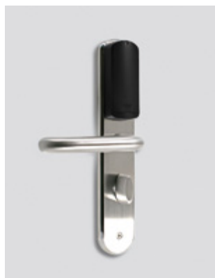
Back view / knob for deadbolt