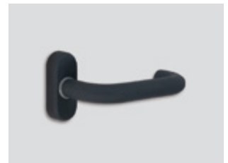
Cobalt kinetics Metallic matte effect