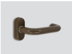
Elite FDE Matte effect