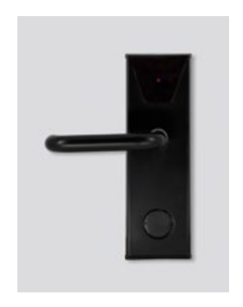
Elite blackout Elite titanium