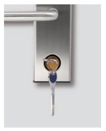
Emergency override key