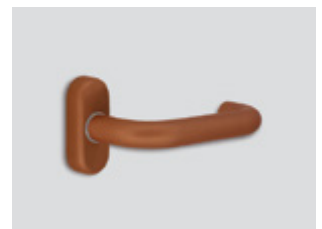
Copper Metallic matte effect

The basic color of the locks is inox satin. / Supreme chromatics shades are optional.