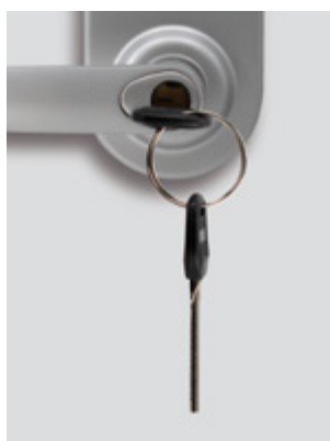
Emergency override key