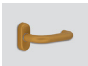
Gold Metallic matte effect

Supreme chromatics went head-up in the salt chamber 2034 hours!