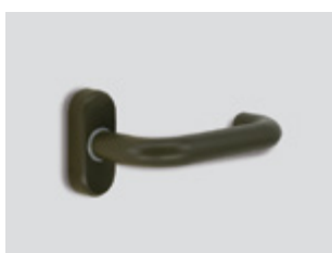
Elite moss Matte effect