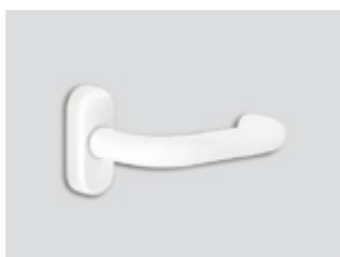
White Matte effect