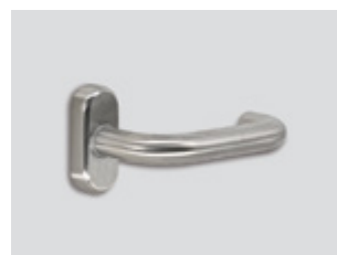
Clear coating Gloss effect

* The elite shades are among the most durable shades, ideal for extreme weather conditions