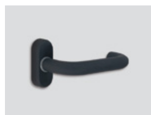
Cobalt kinetics Metallic matte effect