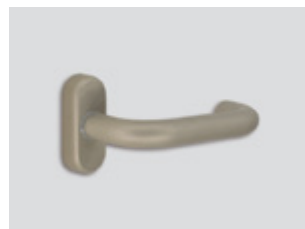
Bright nickel Metallic matte effect