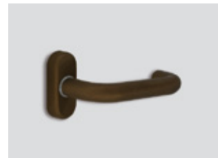
Burnt bronze Metallic matte effect