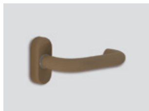
Desert sand Matte effect