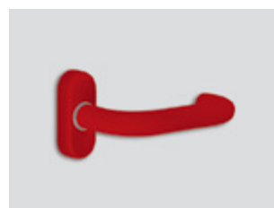
Red Matte effect