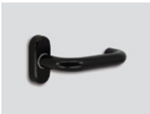
Elite blackout Matte effect