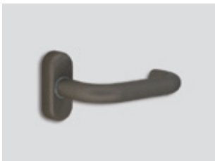
Titanium Metallic matte effect