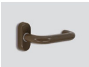
Elite FDE Matte effect