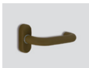
Olive Matte effect