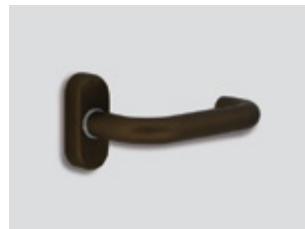
Midnight bronze Metallic matte effect