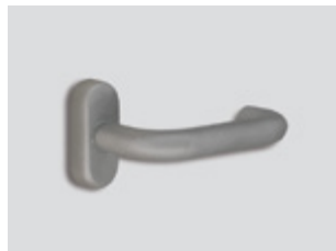
Satin aluminum Metallic matte effect