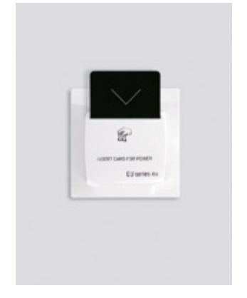
Profile view Card in the slot