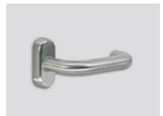
Clear coating** Gloss effect