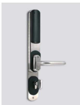
Back view / knob for deadbolt