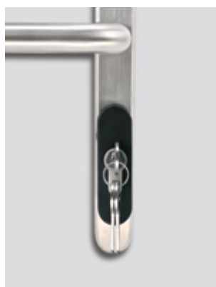
Emergency override key