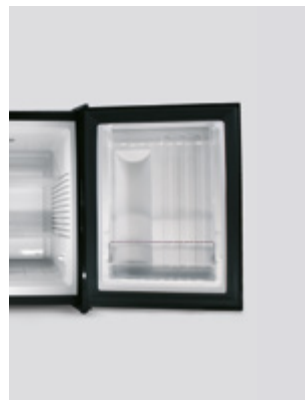
Space for 1.5 liters bottle