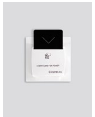
Card in the slot