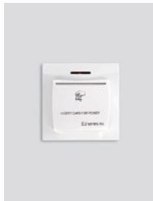
Basic version (white)