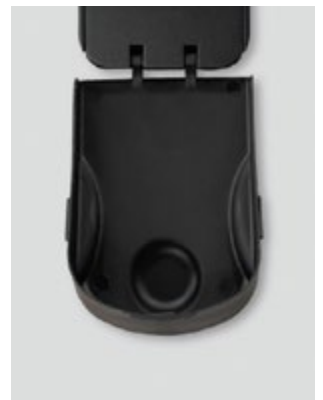
Water resistant cover