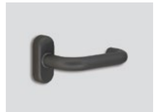
Elite* titanium Metallic matte effect