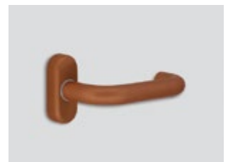
Copper Metallic matte effect

The basic color of the locks is inox satin. / Supreme chromatics shades are optional.