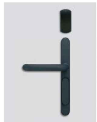
Cobalt kinetics (optional cylinder cover)