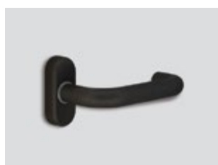
Cobalt Metallic matte effect