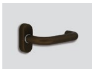
Midnight bronze Metallic matte effect