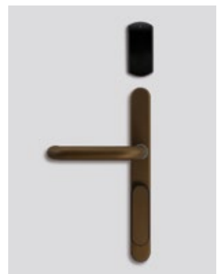
Burnt bronze (optional cylinder cover)