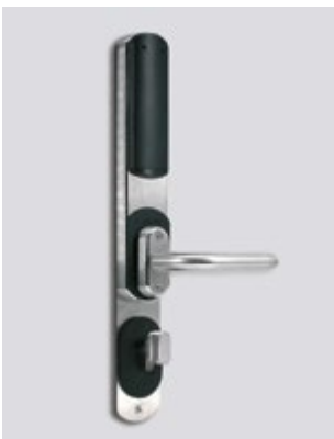
Back view / knob for deadbolt