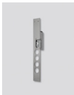
Connect with electric strike