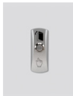
Connect with exit button