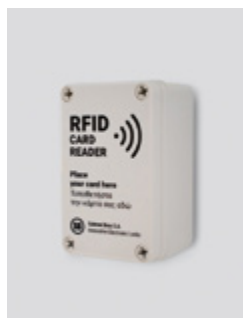
Optional IP66 card reader