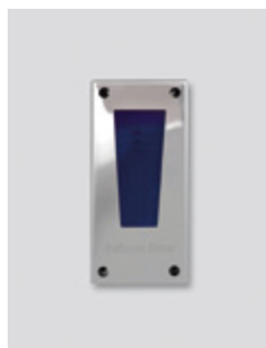
Optional protection cover