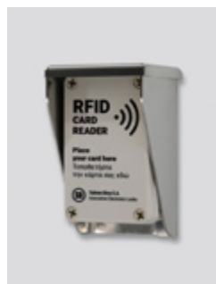
Optional IP66 card reader with protection cover