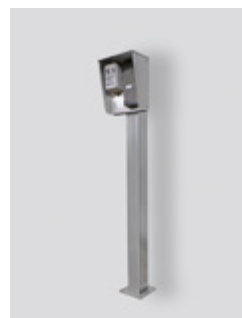
Optional IP66 card reader with protection cover & column