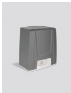
Connect with automatic door