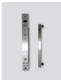
Connect with electric magnet