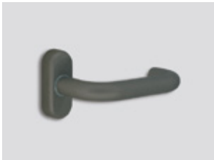
Titanium Metallic matte effect