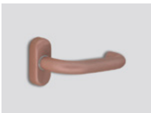
Rose gold Metallic matte effect