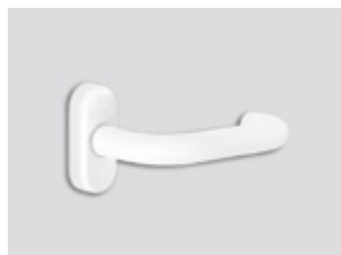
White Matte effect