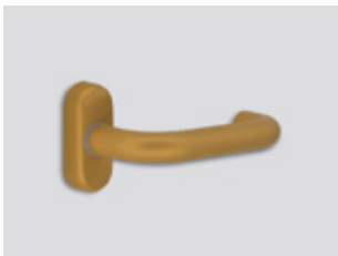
Gold Metallic matte effect

Supreme chromatics went head-up in the salt chamber 2034 hours!