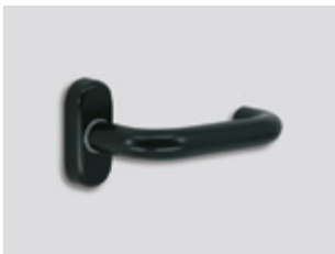
Elite* blackout Matte effect