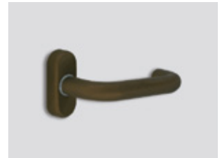
Burnt bronze Metallic matte effect