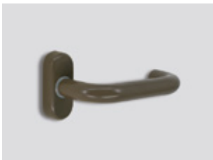
Elite* FDE Matte effect