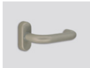
Bright nickel Metallic matte effect