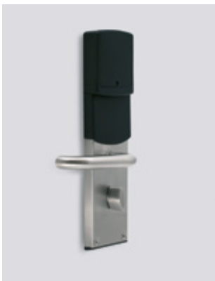
Back view / knob for deadbolt