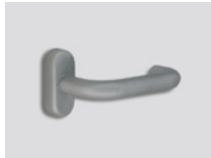
Satin aluminum Metallic matte effect