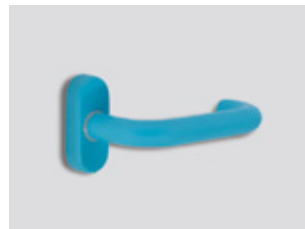
Blue raspberry Matte effect