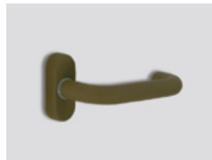
Olive Matte effect