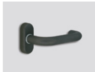
Tungsten Metallic matte effect