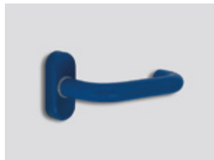
NRA blue Matte effect