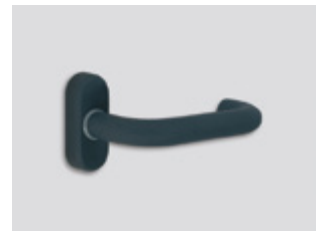
Cobalt kinetics Metallic matte effect