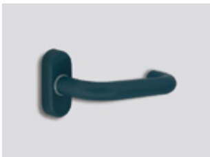
Blue titanium Metallic matte effect