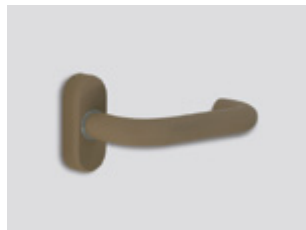
Desert sand Matte effect