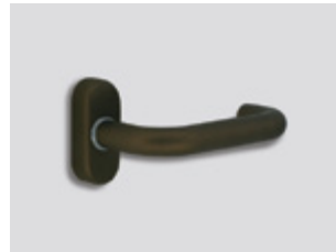
Midnight bronze Metallic matte effect