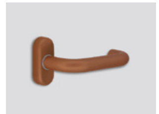
Copper Metallic matte effect

The basic color of the locks is inox satin. / Supreme chromatics shades are optional.