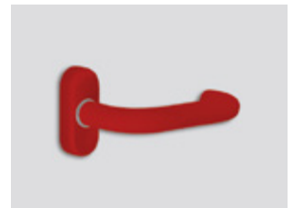
Red Matte effect