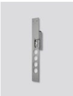
Connect with electric strike