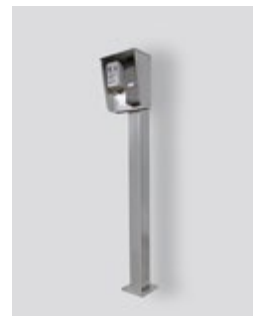
Optional IP66 card reader with protection cover & column