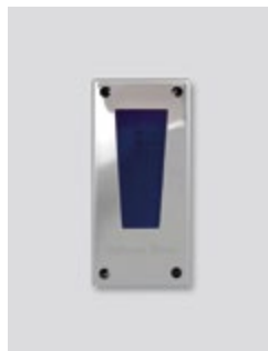
Optional protection cover