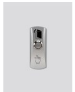
Connect with exit button