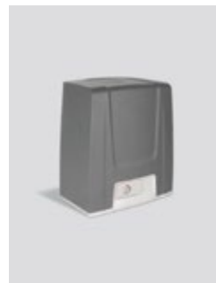
Connect with automatic door