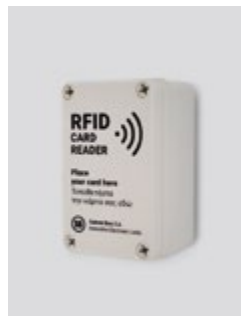
Optional IP66 card reader