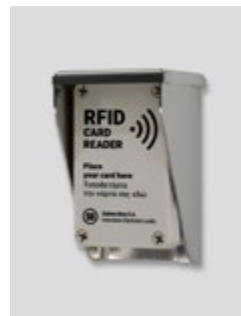
Optional IP66 card reader with protection cover