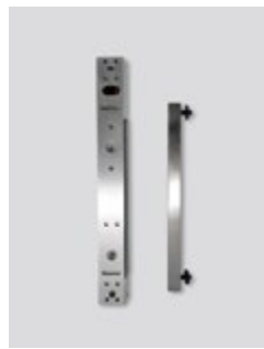
Connect with electric magnet