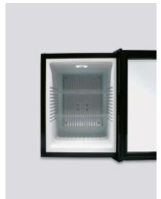
Interior view / LED light