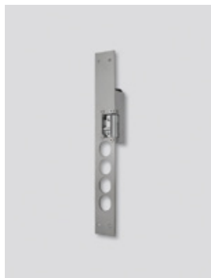
Connect with electric strike