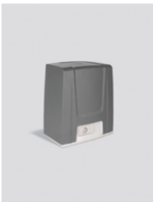
Connect with automatic door