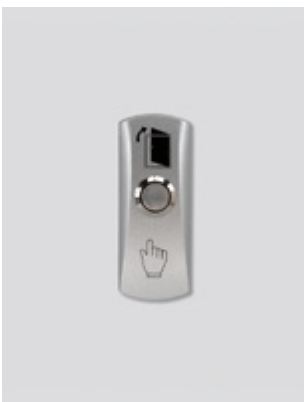
Connect with exit button