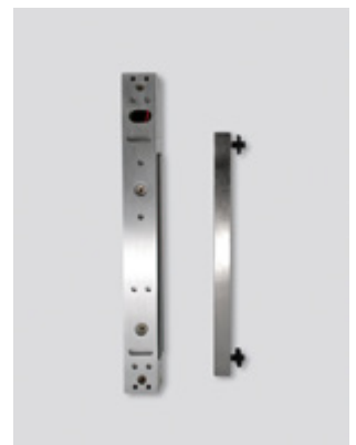
Connect with electric magnet