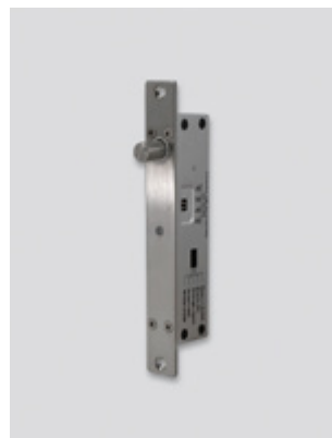
Connect with power bolt