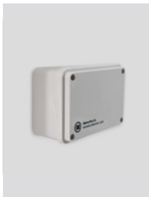
Indoor control device