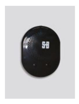
SB Hub (optional)