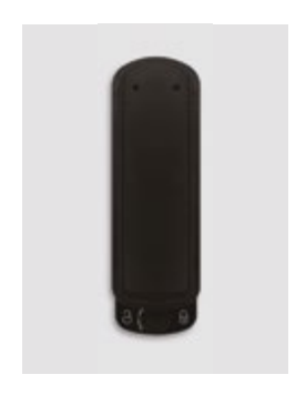
BLE drive / SB drive indoor lock-unlock button