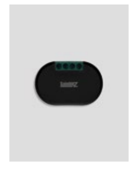
WAI wireless sychronization device