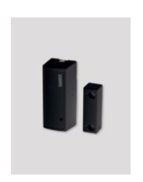
Door status sensor