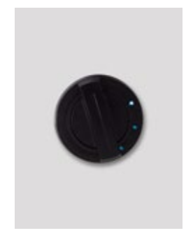
Back view / battery case, knob for manual operation