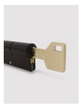
Front view / emergency kev