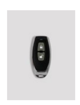
RC wireless controller