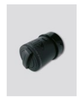
Control buttons / charging port