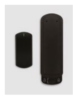
RFID card reader (IP65) / indoor lock-unlock button