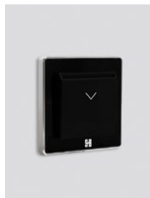
Profile view / metallic frame