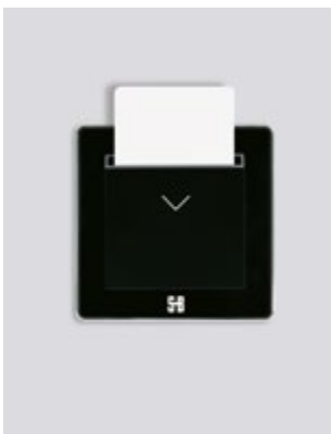
Card in the slot