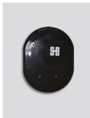
SB Hub (optional)