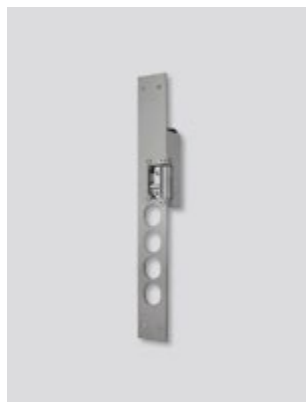
Connect with electric strike