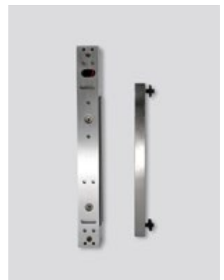
Connect with electric magnet