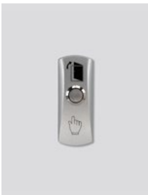
Connect with exit button