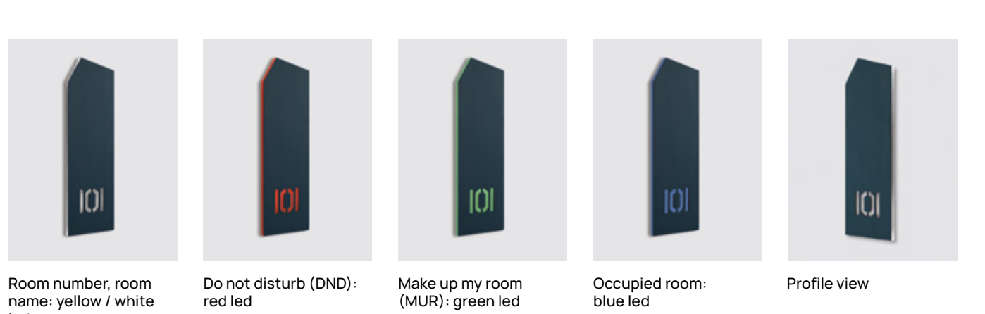
Occupied room: blue led