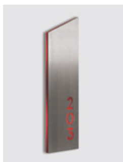
Do not disturb (DND): red led