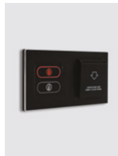
Handmade combo / in-room panel & card switch. Do not disturb led on