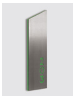
Make up my room (MUR): green led