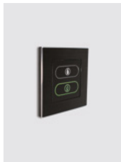
Handmade in-room panel. Make up my room led on