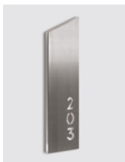
Room number, room name: yellow / white led