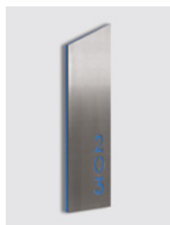
Occupied room: blue led