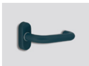
Blue titanium Metallic matte effect