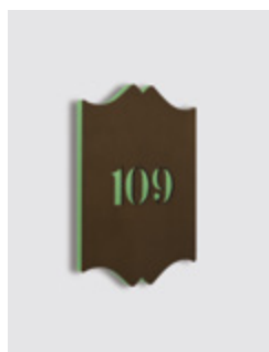
Make up my room (MUR): green led