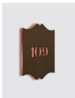
Do not disturb (DND): red led