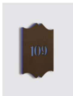
Occupied room: blue led