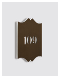
Room number, room name: white led