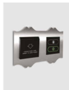
Handmade combo / in-room panel & card switch traditional in inox satin. Make up my room led on.