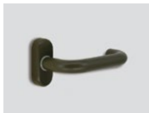
Elite* moss Matte effect