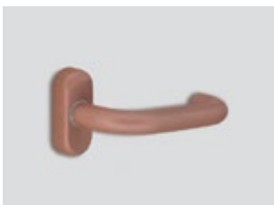
Rose gold Metallic matte effect