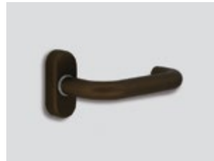
Midnight bronze Metallic matte effect