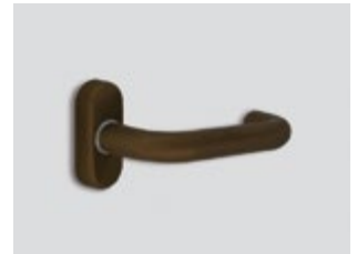
Burnt bronze Metallic matte effect