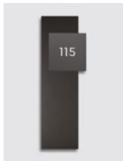
Tungsten & elite titanium