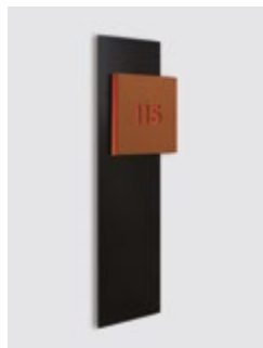
Do not disturb (DND): red led