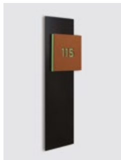
Make up my room (MUR): green led