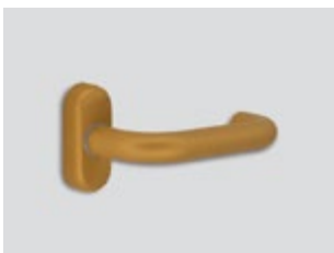
Gold Metallic matte effect

Supreme chromatics went head-up in the salt chamber 2034 hours!