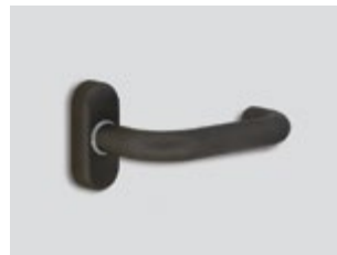
Tungsten Metallic matte effect