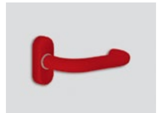
Red Matte effect