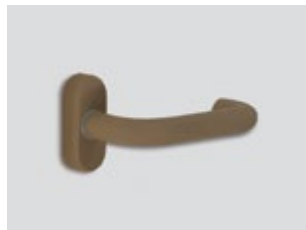
Desert sand Matte effect