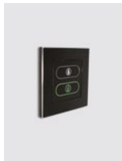
Handmade in-room panel. Make up my room led on