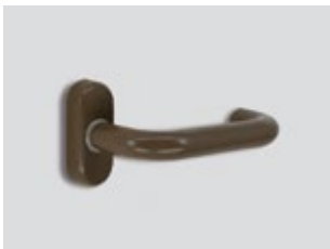
Elite* FDE Matte effect