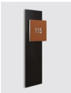
Room number, room name: white led