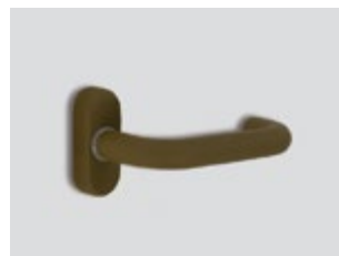
Olive Matte effect