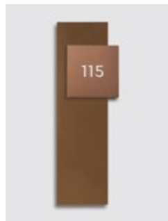
Burnt bronze & midnight bronze