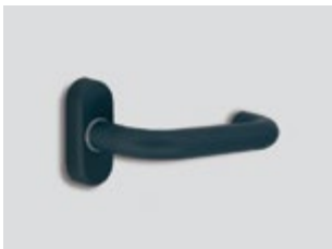
Blue titanium Metallic matte effect