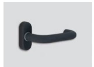
Cobalt kinetics Metallic matte effect