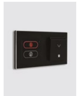
Handmade combo/ in-room panel & card switch. Do not disturb red led on