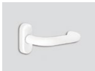
White Matte effect

* The elite shades are among the most durable shades, ideal for extreme weather conditions