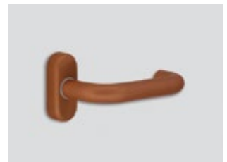
Copper Metallic matte effect

The basic color of the locks is inox satin. / Supreme chromatics shades are optional.