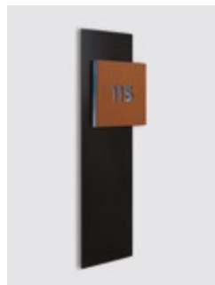
Occupied room: blue led