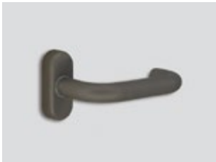
Titanium Metallic matte effect