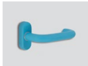
Blue raspberry Matte effect