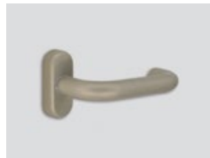
Bright nickel Metallic matte effect