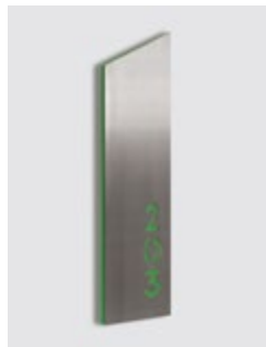
Make up my room (MUR): green led