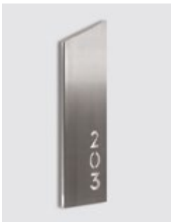
Room number, room name: yellow / white led