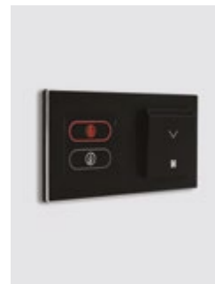
Handmade combo / in-room panel & card switch. Do not disturb led on