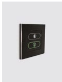
Handmade in-room panel. Make up my room led on