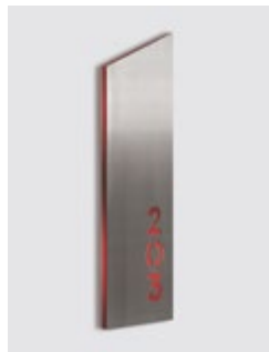
Do not disturb (DND): red led