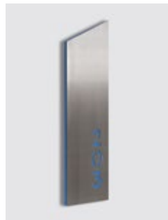
Occupied room: blue led