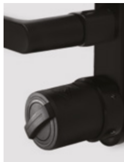
Control buttons / charging port