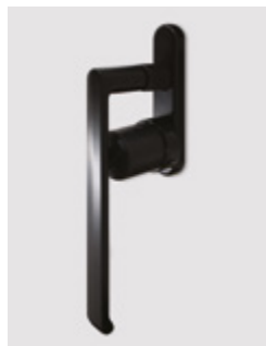
Back view / battery case, knob for manual operation