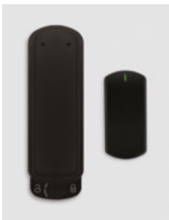
RFID card reader (IP65) / indoor lock-unlock button

— You can leave your existing handles adding the metal solid extension