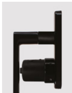
Metal solid extension for lift and slide handles. Compatible for GU/HOPPE