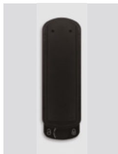
BLE / indoor lock- unlock button