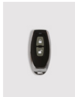
RC wireless controller