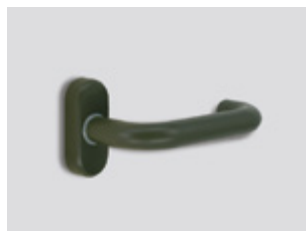
Elite* moss Matte effect