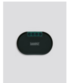
WAI wireless synchronization device