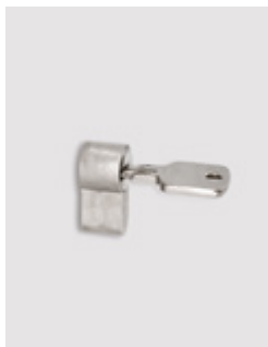
Front view / emergency key