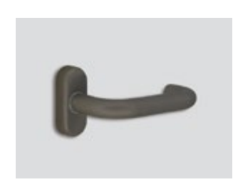
Titanium Metallic matte effect