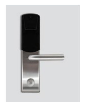
Inox satin Satin br