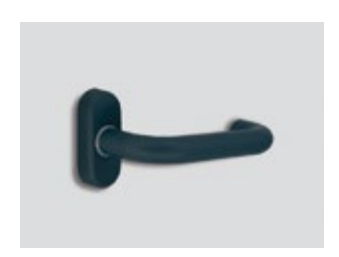
Blue titanium Metallic matte effect