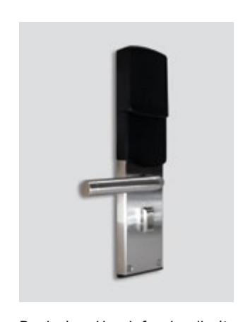
Back view / knob for deadbolt