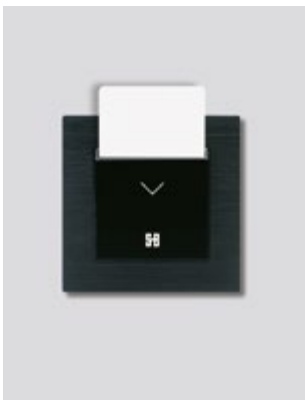
Card in the slot