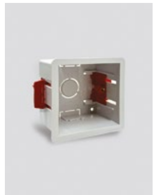
Installation box for plasterboard