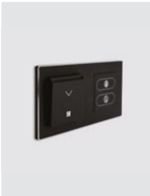
Profile view / metallic frame