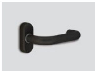
Cobalt Metallic matte effect