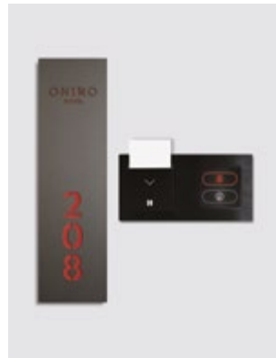
DND (indicator panel & in-room panel & card switch)