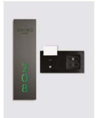
MUR (indicator panel & in-room panel & card switch)