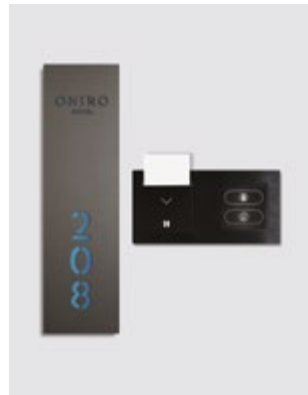
Occupied room (indicator panel & in-room panel & card switch)