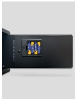
Battery case / LED interior light