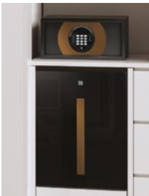
Burnt bronze (SBOX safe & HS-40 mini bar)