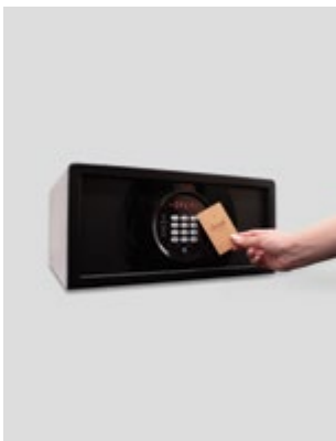
Keypad / RFID reader