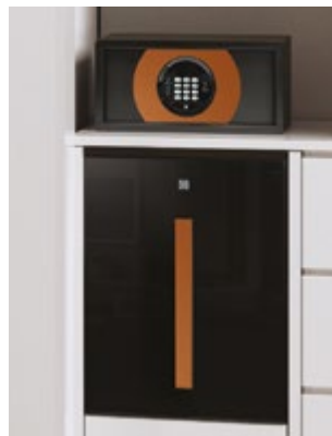
Copper (SBOX safe & HS-40 mini bar)