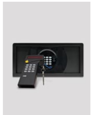
Emergency override key / handset tool